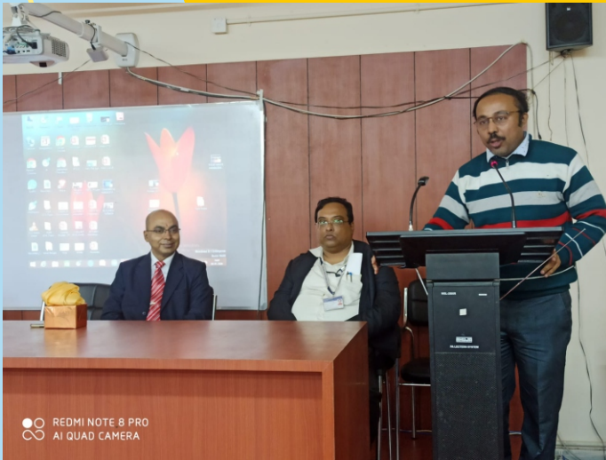
Session on Tally Hands-on Training by G-TEC Education