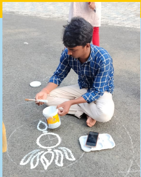
Alpana Competition at WBSU Campus