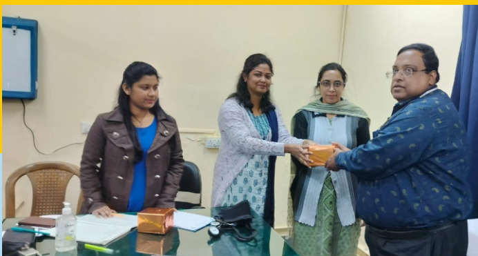
Health Check-up of the students at WBSU and the doctor is being felicitated on 08.01.2024.