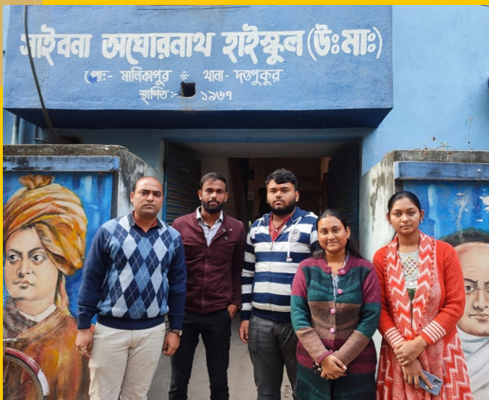
Fruit Distribution in local school after visiting by teachers, students and research scholars of WBSU