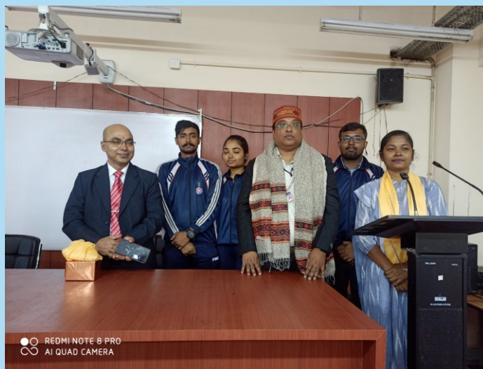
Session on Adventure Camp by awardee NSS Volunteers and P.O. of West Bengal State University